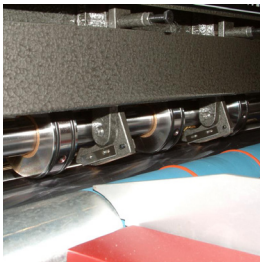
Shaft with two semi-slitting blades