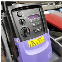
Variable speed controller